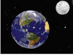
Moon/move/around the earth