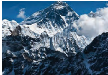
Mt. Everest/the highest mountain