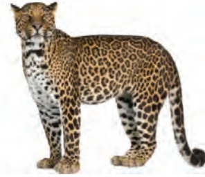
Leopard/fastest animal/in the world